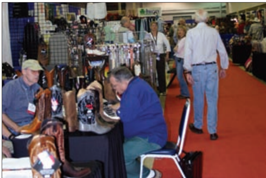
Attitudes were upbeat on the market floor as exhibitors helped buyers make purchasing decisions.