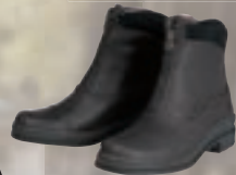
ARIAT® GLACIER ZIP