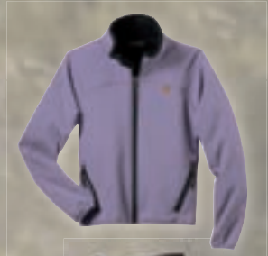
ARIAT® POWER SHIELD JACKET II