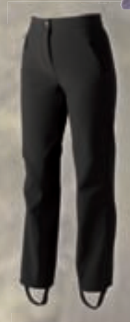
ARIAT® FLURRY PANT