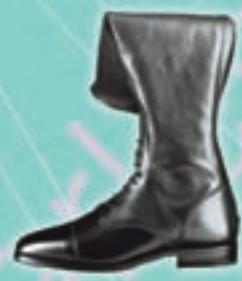
italian riding boots