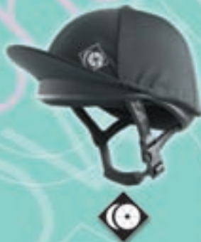
hats, helmets and vests